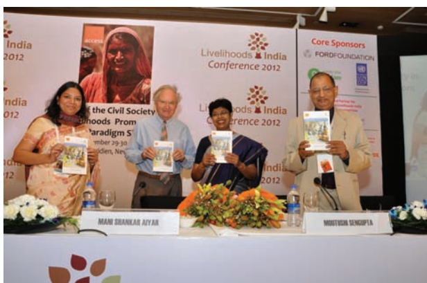
Release of Sitaram Rao Livelihoods India Case Study Compendium

Dedicated to Late Shri Sitaram Rao, mentor and guru of the Indian microfinance and livelihoods movement, the case study competition aims to bring together the collective intellect in the country and assimilates innovative solutions, breakthroughs, good experiences and best practices that can help change the poverty status in India. The 2012 case study competition was supported by Oxfam India and Ford Foundation. ACCESS also partnered with XLRI to make the initiative more robust. The theme for the 2011 competition was “Enhancing Livelihoods of Poorest of the Poor.” In all, 118 entries were received. After undergoing a rigorous evaluation process, 11 cases were shortlisted for presenting before the expert Jury for adjudging the three best cases. The final result from the collective decision of the Jury is as follows: