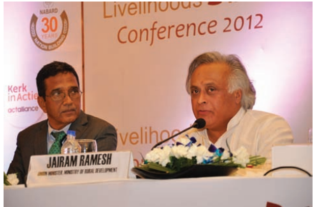
Shri Jairam Ramesh, Hon'ble Union Minister for Rural Development, Government of India delivering his special address

According to Shri Jairam Ramesh, CSOs can play a catalysing role in NRLM in the following ways: