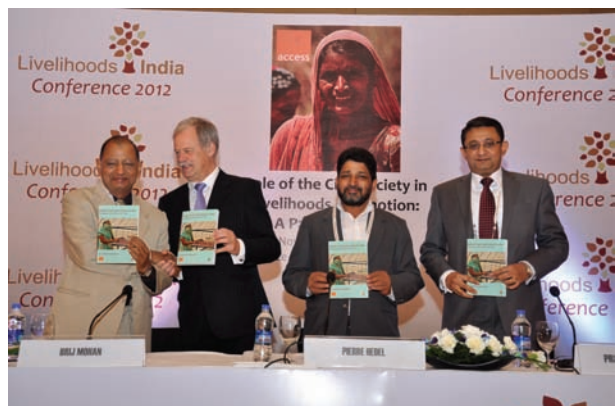
Release of the book on Agro-processing titled "Making Value Chains work for the Poor"

Small farmers do not have sufficient bargaining power to negotiate the