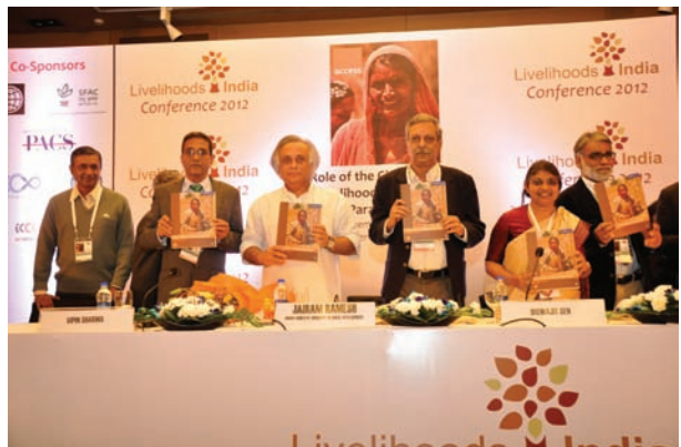
Release of the State of India's Livelihoods (SOIL) Report