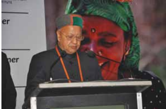
Virbhadra Singh, Hon'ble Union Minister for Micro, Small and Medium Enterprises, Government of India delivering the Valedictory Address of the Livelihoods India Conference.

In his Valedictory Address, Shree Virbhadra Singh, Hon'ble Union Minister for Micro, Small and Medium Enterprises appreciated the Conference as a platform to discuss the livelihoods promotion issues in India. He stated that poverty reduction and livelihood generation have always been the key concern for the Government of India. Citing examples, he mentioned that the Government has